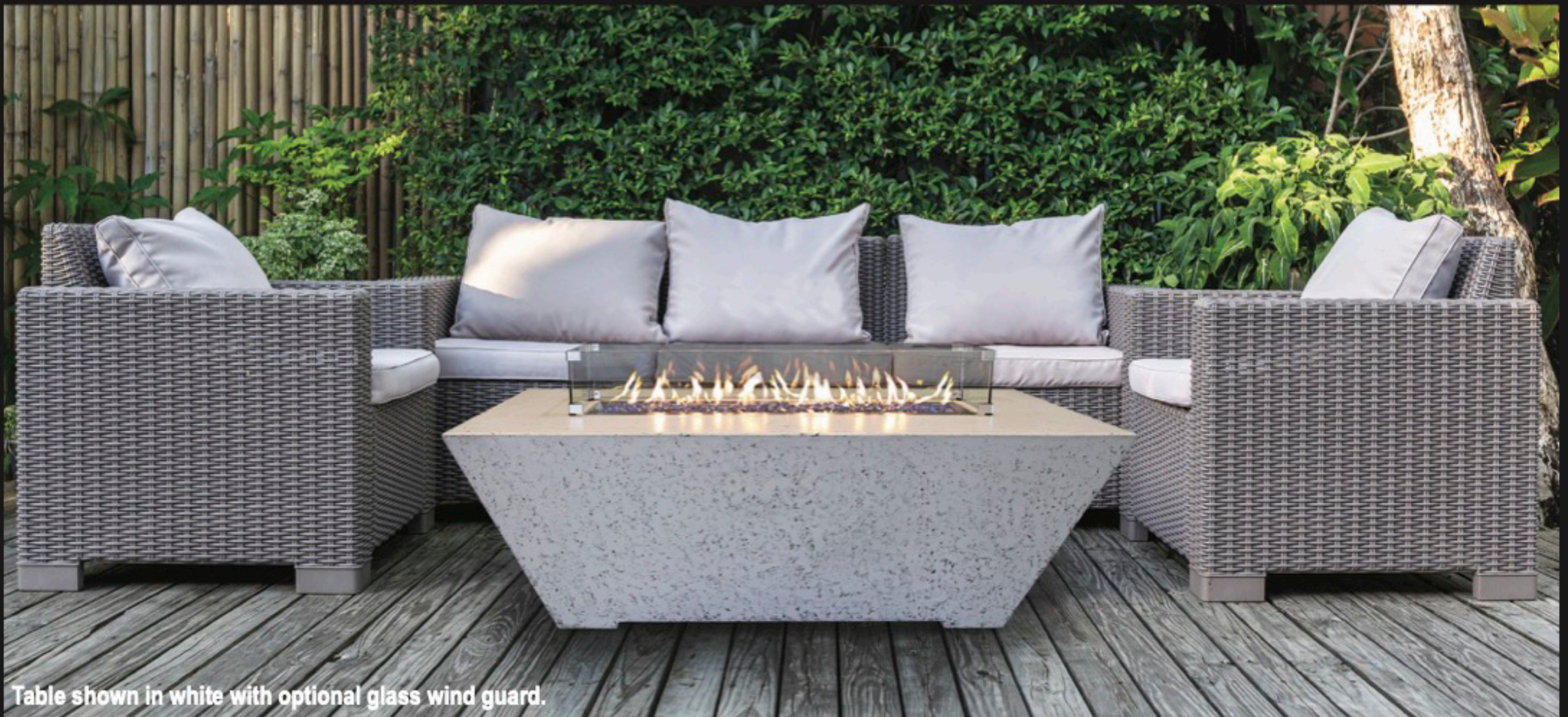
Table shown in white with optional glass wind guard.